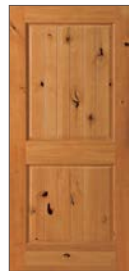
Knotty Alder 2-Panel V-Groove