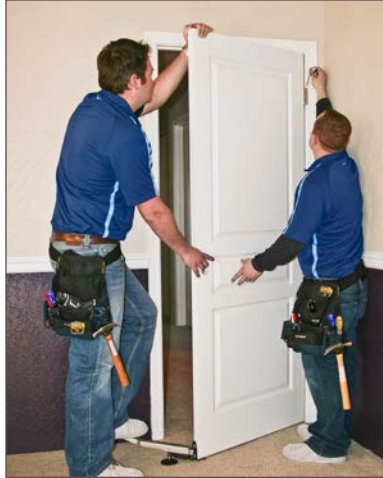
New doors and hardware are installed