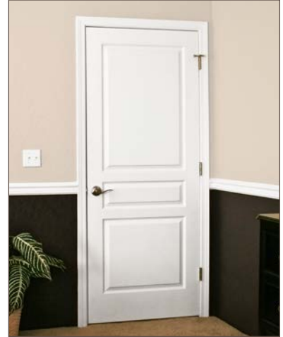
After final inspection, your home is left clean and doors are ready to use with no additional work needed