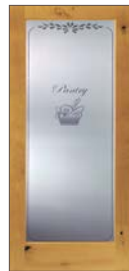
Cherry Pantry Door