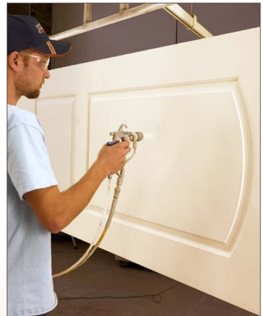
Factory finish can be applied in 9 standard colors or any custom color of your choice