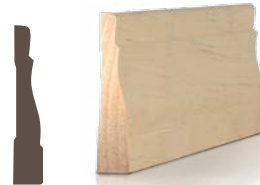
Clear 3-1/4" Pine