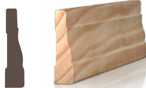
Clear 2-1/2" Pine