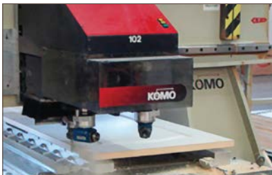
CNC Router cuts the door's contours and mortises the hinges and bores