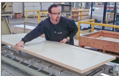
Routing, sanding and painting of the new door is done at the JELD-WEN plant