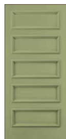
5-Panel C5000 w/raised moulding