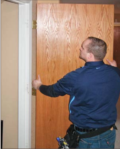
Your existing doors are removed

Hassle Free Installation A professional team will install your beautiful new doors, hardware, trim and accessories for a Hassle-Free dramatic improvement to your home. Your home is left clean and doors are ready to use with no additional work needed.