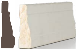
Primed 2-1/4" Pine

Ask your consultant for other options available in your area.