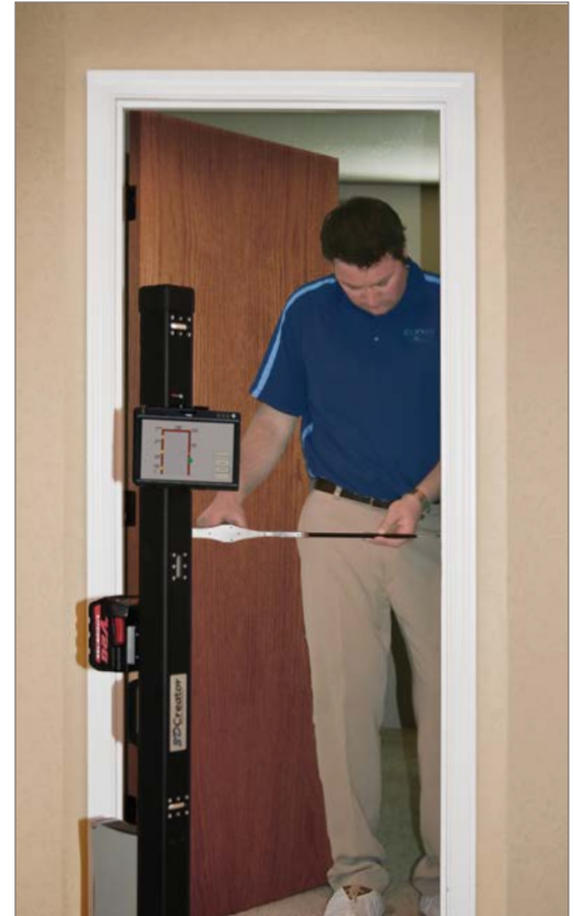
Taking 3-D measurements for the contour of each door opening.

This insures the Quick, Easy and Hassle-Free installation of your beautiful and reliable custom made doors.