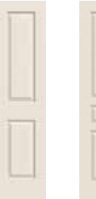
Avalon® Modified Cove & Bead Sticking 6'8" & 7'0"