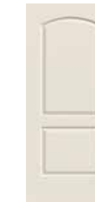
Continental™ Commercial Wide-Stile Smooth Surface Ovolo Sticking Profile

These doors accommodate commercial-grade hardware and many types of locking systems. Because of their solid core construction, they also provide remarkable sound reduction for privacy where commercial projects demand it.