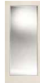
Beveled Mirror Reverse Side: All panel designs except Madison 6'8"