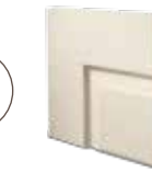
Modified Cove & Bead Sticking