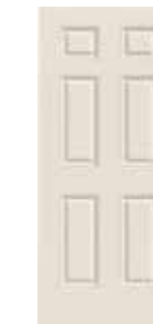
Arlington Commercial Wide-Stile Smooth Surface Beaded Sticking Profile