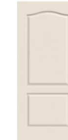
Cambridge Ovolo Sticking 6'8", 7'0" & 8'0"