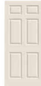
Bristol Modified Cove & Bead Sticking 6'8", 7'0" & 8'0"