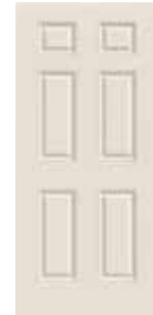
Arlington Beaded Sticking Exclusive to JELD-WEN 6'8", 7'0" & 8'0"