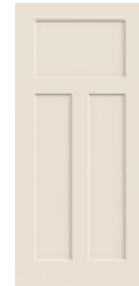
Craftsman III™ Flat Panel Craftsman Sticking 6'8" & 7'0"