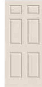
Colonial Ovolo Sticking 6'8", 7'0" & 8'0"