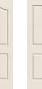
Stanford® Ovolo Sticking 6'8" & 7'0"