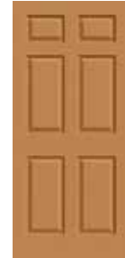
Prefinished 6-Panel Modified Cove & Bead Sticking 6'8" & 7'0" (Non-stock)