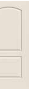
Princeton Modified Cove & Bead Sticking 6'8", 7'0" & 8'0"