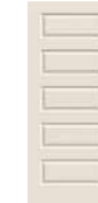
Rockport® Modified Cove & Bead Sticking 6'8", 7'0" & 8'0"