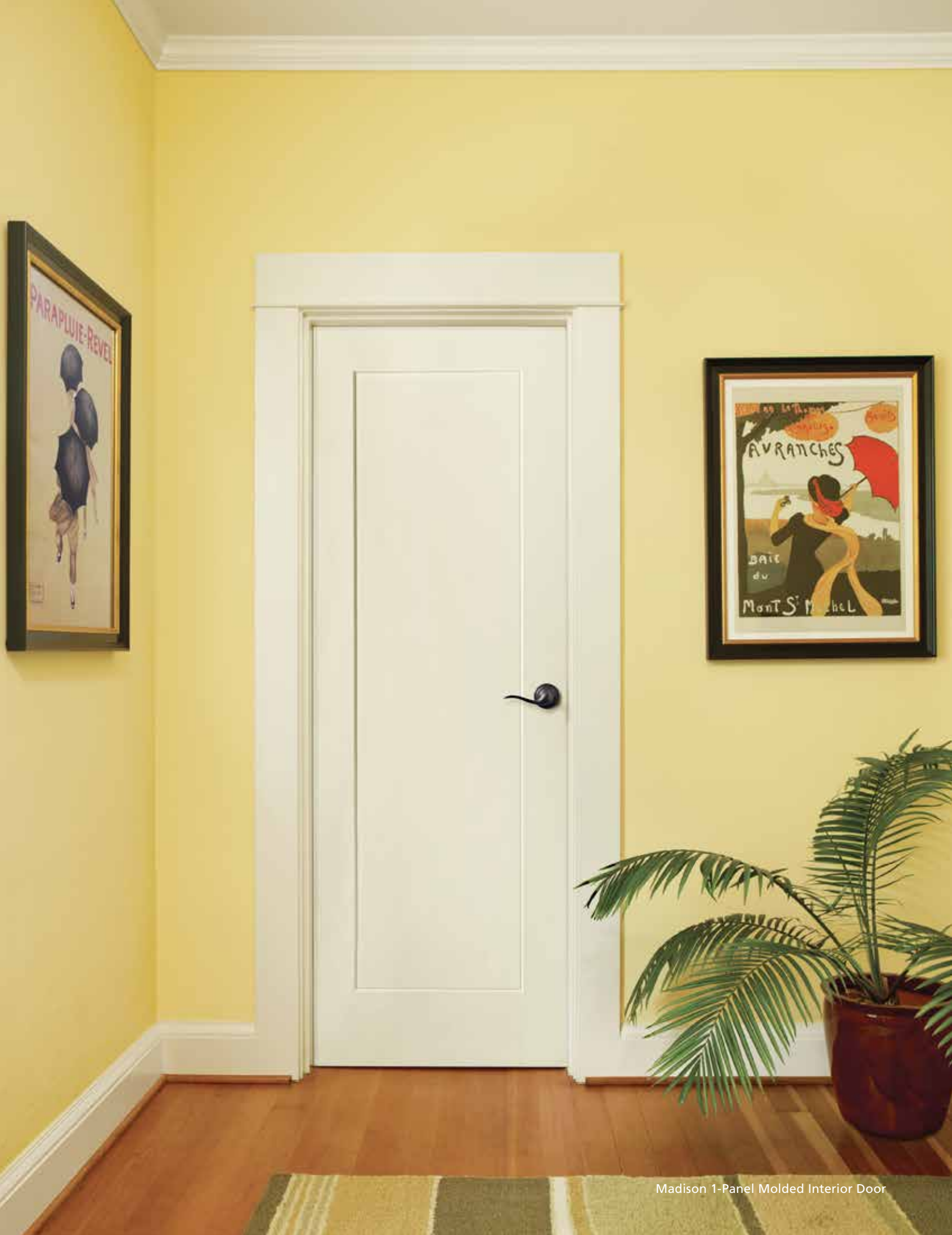
Madison 1-Panel Molded Interior Door