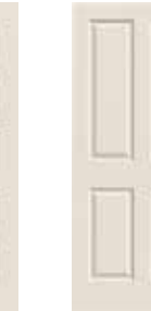
Atherton® Ovolo Sticking 6'8", 7'0" & 8'0"