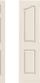
Provincial® Ovolo Sticking 6'8" & 7'0"