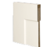
Craftsman Sticking JELD-WEN Exclusive

Whether traditional or contemporary, JELD-WEN has sticking profile options that will distinguish the interior of your home with beautiful quality and attention-to-design detail.