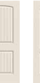
Continental™ Ovolo Sticking 6'8", 7'0" & 8'0"