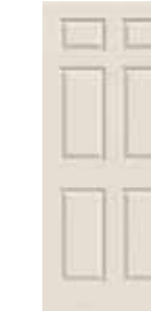
Bostonian® Modified Cove & Bead Sticking 6'8", 7'0" & 8'0"