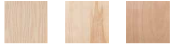
Sliced Red Oak Rotary-Cut Birch Tropical Hardwood

Offered in several additional species (varies by region, please check with your dealer)