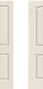
Santa Fe Ovolo Sticking 6'8", 7'0" & 8'0"