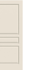
Camden® Modified Cove & Bead Sticking 6'8" & 7'0"