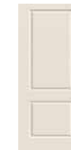
Cambridge Beaded Commercial Wide-Stile Smooth Surface Beaded Sticking Profile