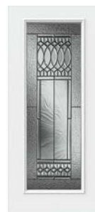
Paris Patina 6'8" only