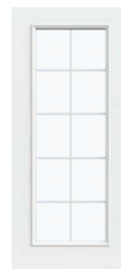
Grilles Between Glass Standard & Prairie 6'8" & 8'0"

Impact Clear, Double Glue Chip and Gray glass designs also available.