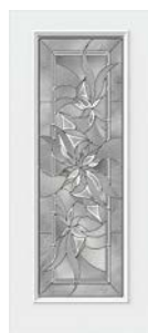
Impressions 6'8" & 8'0"