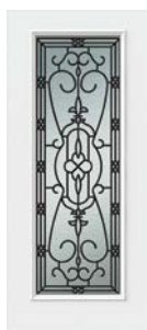
Jacinto Wrought Iron 6'8" & 8'0"