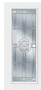
Elegant Star Patina 6'8" only