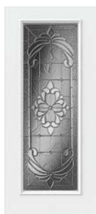
Expressions Brass & Satin Nickel 6'8" & 8'0"