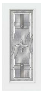
Delray Patina 6'8" & 8'0"

Impact certifications are on the reverse side.