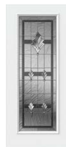
Radiant Hues Nickel 6'8" & 8'0"