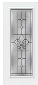
Carrollton Patina 6'8" only