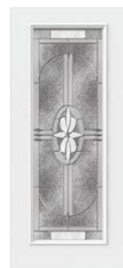
Compass Nickel 6'8" & 8'0"