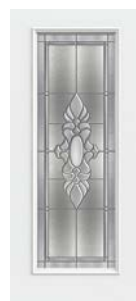
Heirlooms Nickel 6'8" & 8'0"