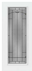
Topaz Patina 6'8" only