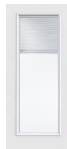
Blinds Between Glass 6'8" & 8'0"