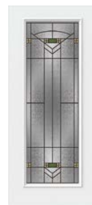
Greenfield Oil-Rubbed Bronze 6'8" only