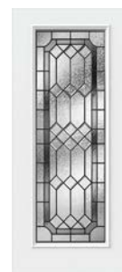
Majestic Nickel 6'8" & 8'0"